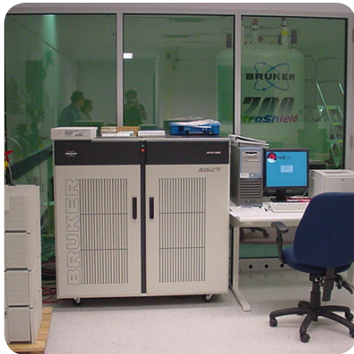
Top: Farncombe Digestive Health Research Institute Center: Canadian Centre for Electron Microscopy Bottom: Arthur Bourns Building Annex (McMaster)