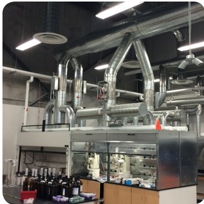
Top: MDCL 2nd Floor Fit-Out (McMaster University) Center: University Health Network Cyclotron Bottom: ALS Life Sciences Lab