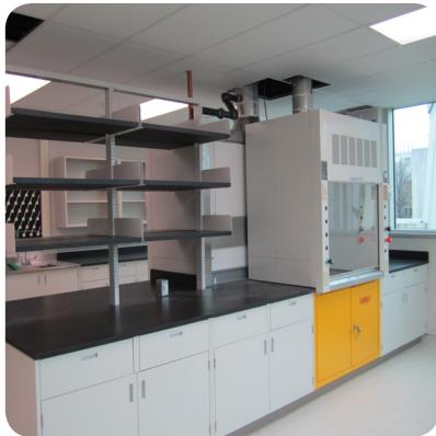
Top: Arthur Bourns Building (McMaster University) Center: McMaster University Nuclear Reactor Bottom: Nuclear Research Building (McMaster)